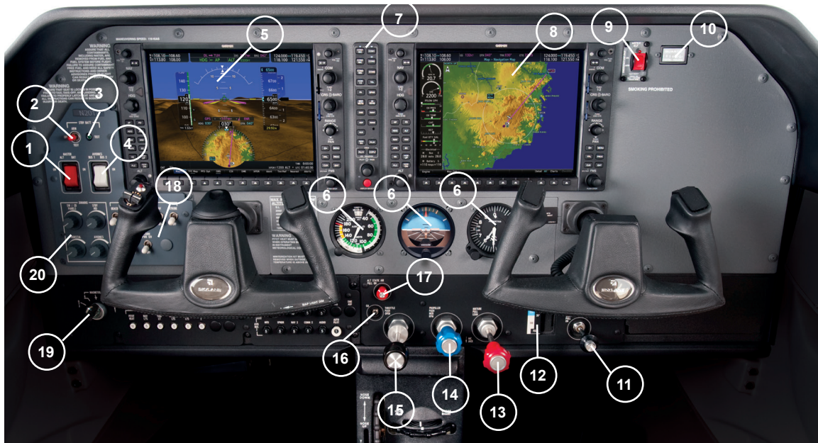
Figure 3: Instrumentation