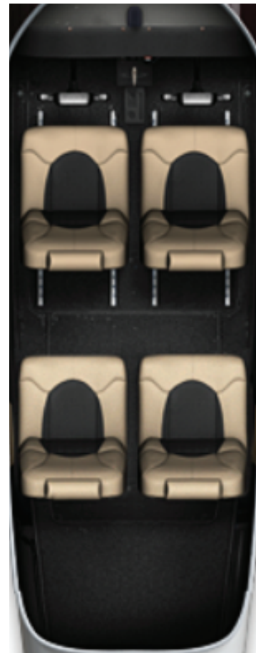
Figure 4: Typical Configuration

Certified burn-resistant materials are used throughout the cabin.